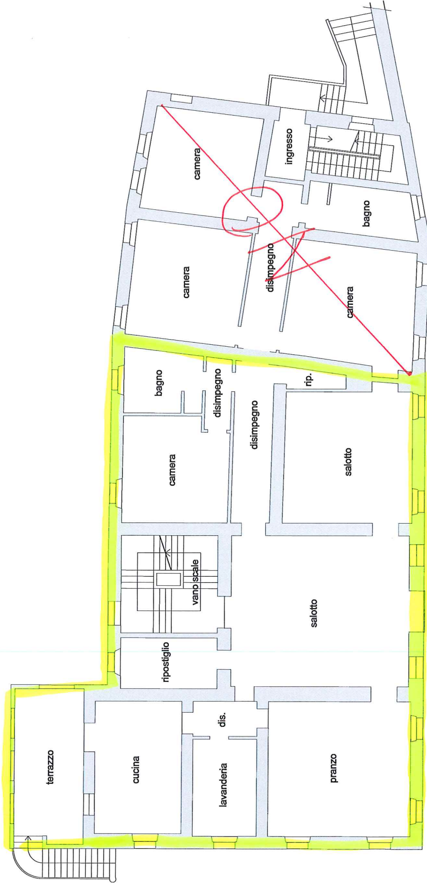
PIANO PRIMO h= ml. 3.30